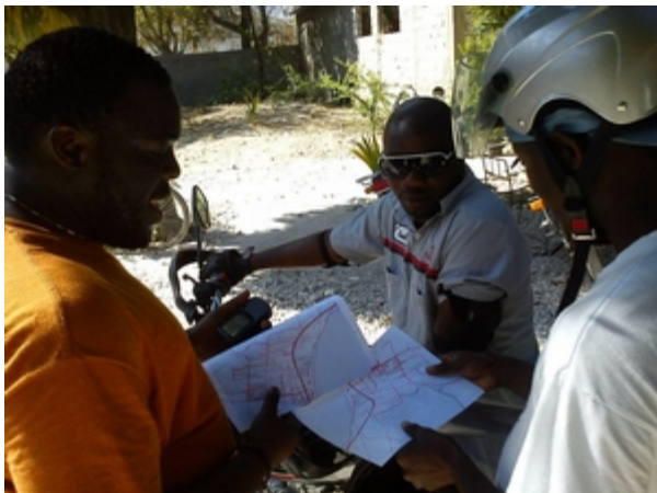
GPS Tracks to collect for the day.

March 2010 was the first HOT mission to Haiti, moving the mapping effort from remote volunteers to teaching those working and living in Haiti how to keep the map up to date.